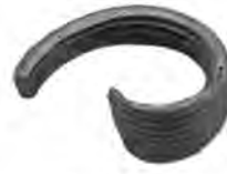
SA-053 H70 * W55