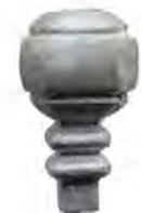
SA-025 H120*W68 □22