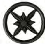
SA-066 H130 * W130