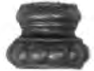
ST-029 H30*W40 ○16