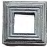
SA-002 A:H22*W98 □44 B:H22*W85 □32