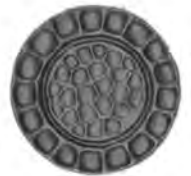
SL-115 φ105 φ56