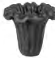
SA-063 H40 * W40