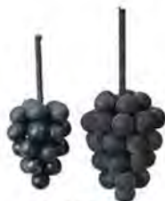
SL-177 A33 SP B22 SP