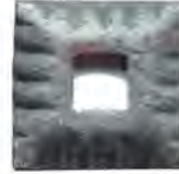
SA-004 A:H15*W80 □25 B:H10*W50 □15