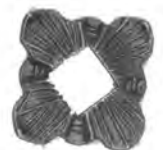
SL-130 H90*W90 φ26