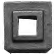
SA-005 H13*W48 □18