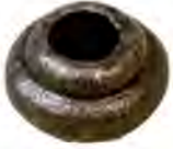
ST-050 H25*W30 \Phi 13