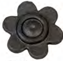
SL-137 Φ 60