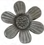
SL-136 Φ 75