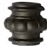
ST-028 H40*W36 ○14