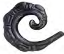
SA-051 H75 - W75