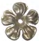
SL-146 Φ 80