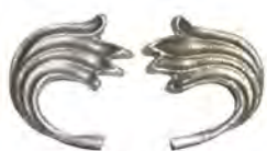
SL-056 H78 * W46