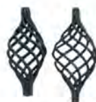
SA-071 A:H155*W74 B:H145*W62