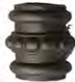
ST-027 H52*W42 □18