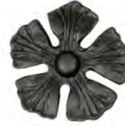
SL-134 A:Φ 118 B:Φ 85