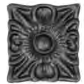
SA-045 H85 * W70