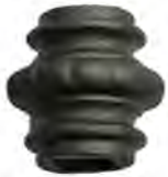
ST-025 H45*W37 □14