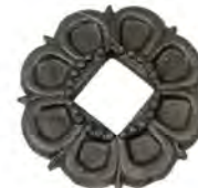
SL-129 φ95 φ30