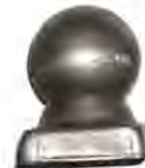
SA-068 □30 H45*W33 Φ30 □40 H55*W44 Φ40 □50 H66*W55 Φ50