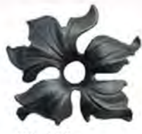
SL-142 Φ 135 Φ 19.5