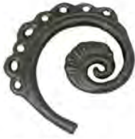
SA-050 H115 * W130