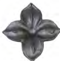
SL-172 \phi 60