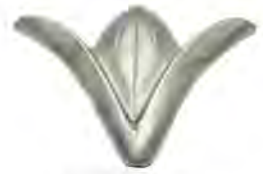
SA-064 A:H140*W263 B:H110*W163 C:H97*W117