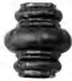
ST-031 H45*W50 □13 H45*W50 □16