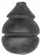
SA-041 H90 * W70