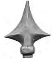
SS-035 H120*W90 □20