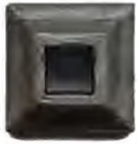
SA-001 H42*W65 □44