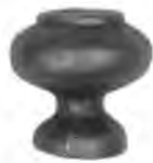
SA-017 H55*W55 ○35