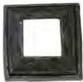
SA-006 H70*W70 □32