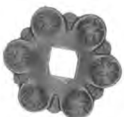
SL-126 H113*W97 φ26