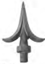
SS-027 H144*W98 □18