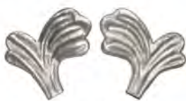
SL-057 H60 * W73