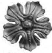
SL-132 Φ 117