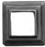
SA-003 A:H18*W80 □14 C:H18*W50 □20 B:H18*W60 □30 D:H15*W40 □12