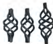
SA-072 A:H160*W60 B:H130*W60 C:H120*W60