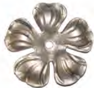
SL-147 Φ 100