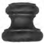
ST-030 H45*W49 □17