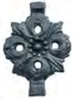
SA-036 H92 * W65