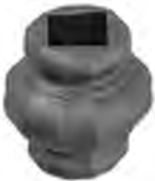
ST-035 H46*W46 □16