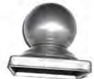
SA-069 □60 H80*W64 Φ60 □80 H105*W85 Φ70 □100 H120*W105 Φ80