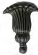
SA-062 H93 * W67