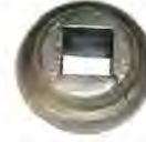
ST-055 \Phi 40*H22 \square 14