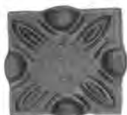
SA-046 H100 * W100