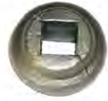
ST-056 \Phi 40*H22 \square 16