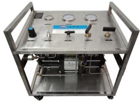
Model C frame type with stainless steel material

DGS gas booster system = booster pump+ following valves, gages, and parts