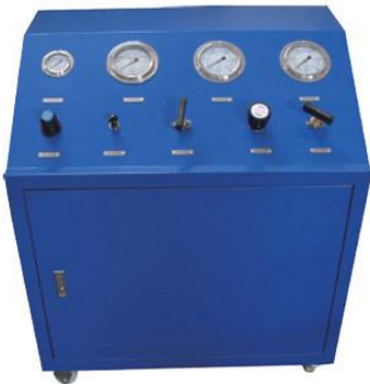
Model A closed type with carbon steel material

For the gas booster filling/test station, we have three different cabinet design for choosing