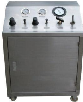
Model B closed type with stainless steel material